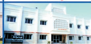
College of Graduate Studies