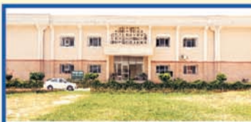
Islamic Research & Training Institute