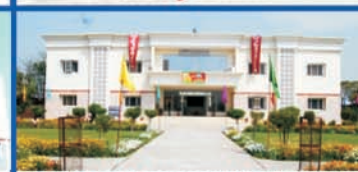
Institute of Management Studies (MBA)