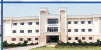
Institute of Education (B.Ed.)