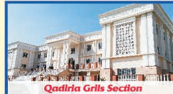
Qadiriya Girls Section