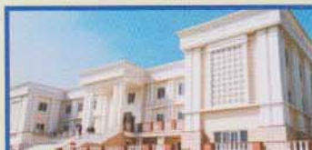
Qadiriya Grils Section