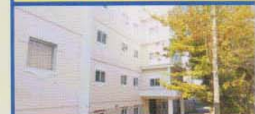
Mehboob Fatima Girls Hostel